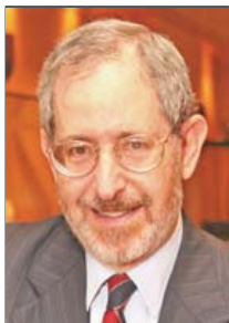
Los Angeles Bankruptcy

Among the many benefits of working at a boutique firm, familiarity with coworkers ranks high for attorneys at Klee, Tuchin, Bogdanoff & Stern LLP. The 20-person firm focuses on bankruptcy work nationally, much of it for debtors. While handling major cases, its small size allows for a strong esprit de corps.